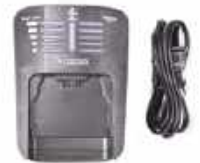
16.8 V Charger