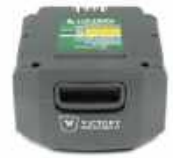
16.8 V Battery