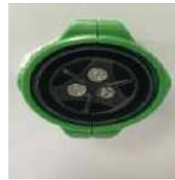
Nozzle #2 (Clean)