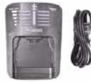
16.8 V Charger