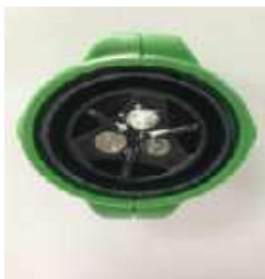
Nozzle #1 (Dirty)

Example below: Nozzle #1 (Dirty) & Nozzle #2 (Clean). Nozzle #1 has not been properly cleaned after being used. When not properly cleaned, residual chemical deposits build up on the sprayer nozzle. Deposit build-up results in decreased bar pressure and decreased spray patterns. The recommendation is that a full tank of water is sprayed through the unit after every few days of use to rinse any residual chemical build-up to reduce the chance of blockage.